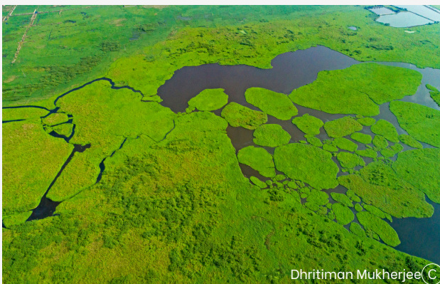
Aerial view of the Dankuni Wetlands