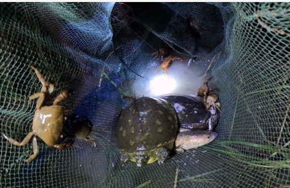
Two Indian flapshell turtles trapped inside a China Duari net deployed in Sahapur wetland. The turtles were rescued and released back into the wild