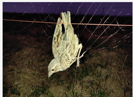
Birbhum is one of the hotspots of commercial lark poaching. The Court directives will empower HEAL to combat such wildlife crime through increased inter-agency cooperation in the district