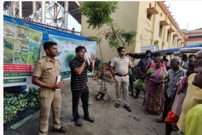
HEAL conducting a sensitisation drive at a fish market in Bharatpur-I block in collaboration with the local police and the forest department