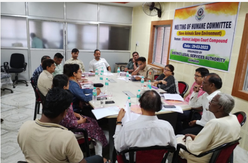
Jhargram Humane Committee in session