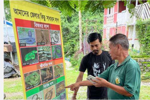
Team HEAL interacting with local communities during the awareness program on World Snake Day