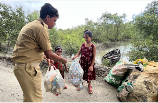
Two young girls from a village in Bali Island handing their lot of plastic waste to a forest official from STR