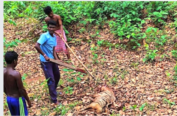
The image that was used to push for enforcement action against the villagers who killed the striped hyena on 01 July in Sijua