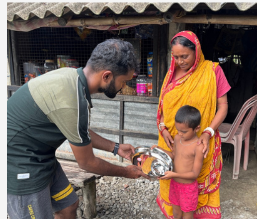
A young boy accepting steel utensils from team HEAL on behalf of his family.