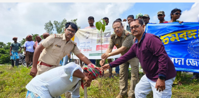
HEAL members at the Ban Mahotsav in Cooch Behar (top) and in Malda (bottom)