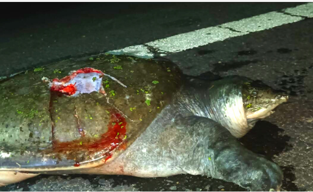
An adult Black Softshell turtle crushed by a motor vehicle on 15 July 2023, in Baneshwar, Cooch Behar