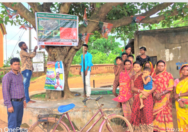
HEAL's field team conducting a poster campaign at a village in Kotulpur block, Bankura