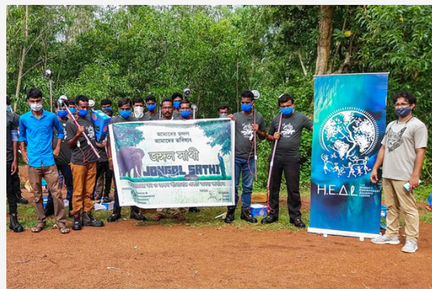
Jongol Sathi - an initiative by HEAL in Jhargram to monitor the movement of elephants and mitigate negative interaction between elephants and people