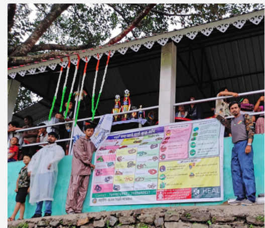
HEAL's Cooch Behar team raising public awareness on snake bite prevention in Buxa Tiger Reserve