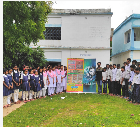
Awareness program held at Tulibar Karmisaran High School in Jhargram